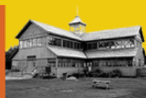
PRINCE EDWARD COUNTY